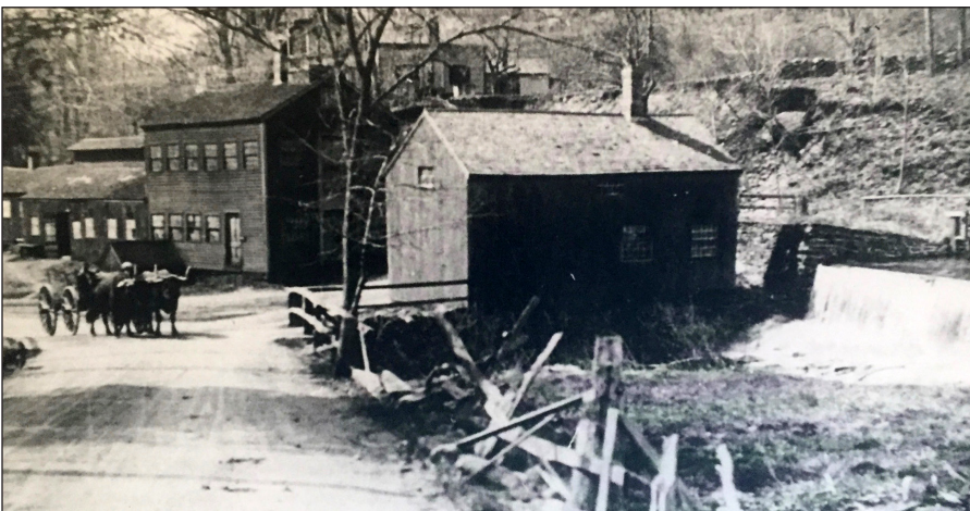
Can you identify the location of this early Chester industrial site? The answer can be found at Chester Museum at The Mill's Two Streams & Many Industries exhibit. (Hint: It's less than 1/2 mile from Chester Center.)