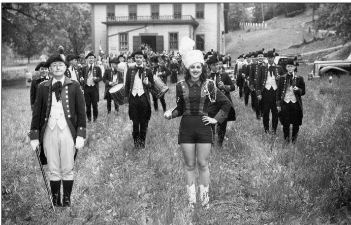
From the Town Green to musters to Presidential Inaugurals, the Chester Fife and Drum Corps has been part of the fabric of Chester for 150 years. Above is a scene from the early 1950s.