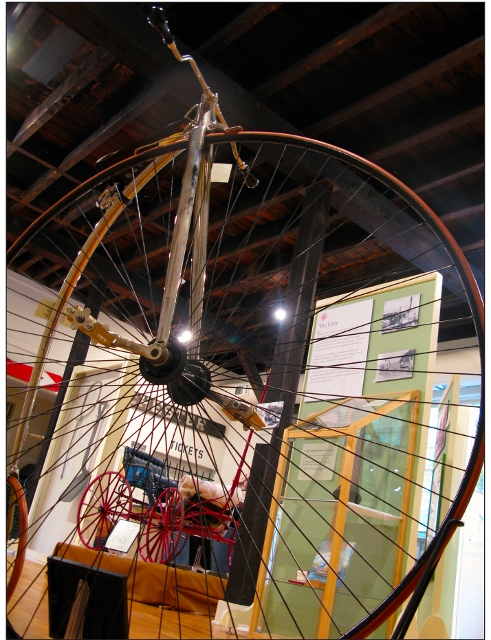
The popular Over the River & Through the Woods transportation exhibit attracted even more visitors when we added a 54" high-wheeled 1880s Columbia Bicycle on loan from the Connecticut Historical Society