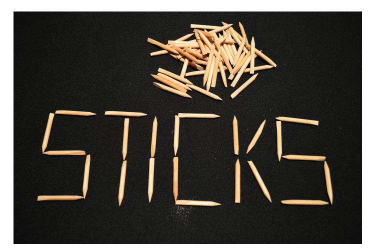
Artists used short manicure sticks made of orangewood and manufactured at Bishop & Watrous Novelty Works, in this year's Creative Challenge Auction & Reception.

The major Main Street construction in the winter required removal of the water trough on the west side of the bridge. The sandstone trough, which dates back more than 100 years, was preserved and moved to a safe location next to Chester Museum at The Mill.