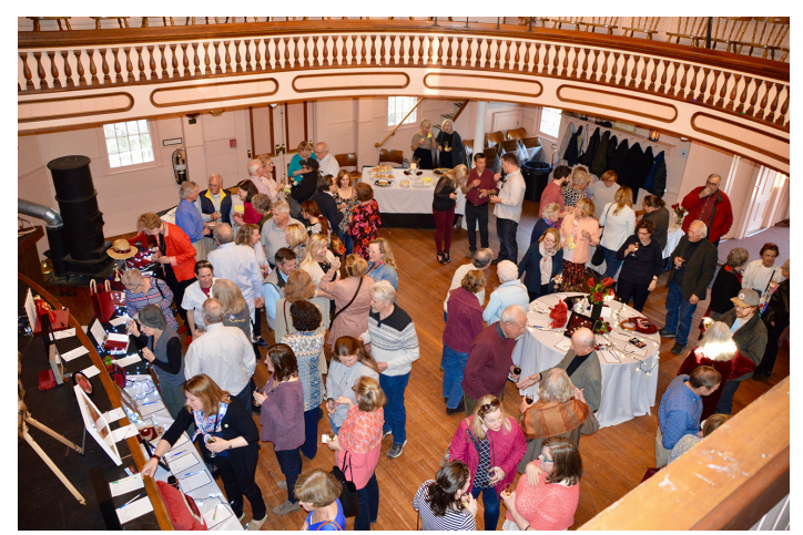
Creative works from 45 artists attracted nearly 100 people to our Creative Challenge Silent Auction in April. The challenge to use pieces of red velvet from a former Meeting House curtain as a source material proved popular, resulting in spirited bidding.