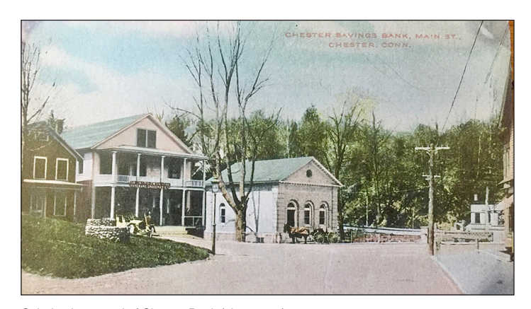
Colorized postcard of Chester Bank (circa 1910)